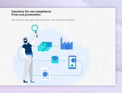
Trade Compliance: Export Control and Embargos